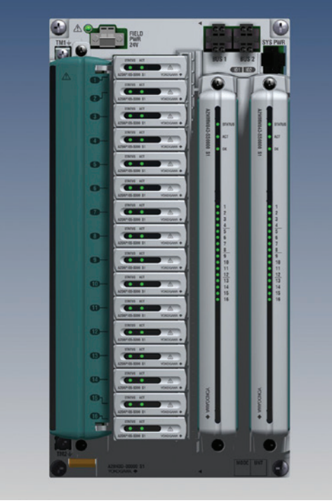
Fig.3. The N-IO field I/O device fulfils the functions of smart configurable I/O, enabling software marshalling and flexible I/O assignment

Flexible I/O binding shortens the duration of a project. After I/O design is fixed, application engineering and hardware engineering can progress independently and in parallel. This is made possible by a capability known as system independent loop commissioning, which uses Yokogawa's FieldMate Validator: an innovative tool allowing the field testing and validation of N-IO without requiring a deployed system.