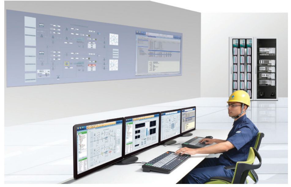
Fig.1. The Yokogawa CENTUM VP® R6.02: a new version of the company's integrated production control system with enhanced functionality

In addition, the Automation Design Suite (AD Suite) engineering tool can now save engineering data, manage the engineering history, and support I/O design for both the process control instrumentation and the safety instrumentation (Fig.4). This improved integration results in enhanced engineering efficiency throughout the entire plant lifecycle.