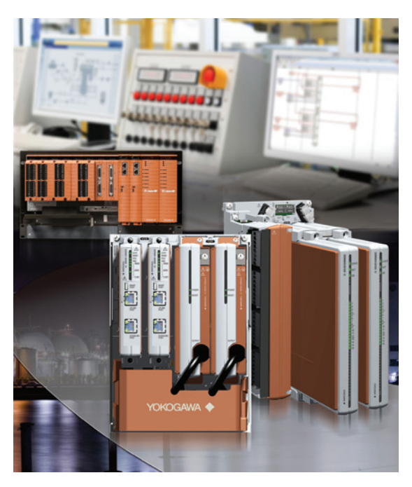
Fig. 2. The latest version (R4.01) of the Yokogawa ProSafe®-RS safety instrumented system

After the control system is sent to a site, design changes often happen due to physical restrictions of implementation or inadvertent miscalculations, and these changes can significantly affect the project schedule. Moreover, shortening the term of a project is an ever-present challenge. Flexible I/O binding, Yokogawa's improved late I/O binding