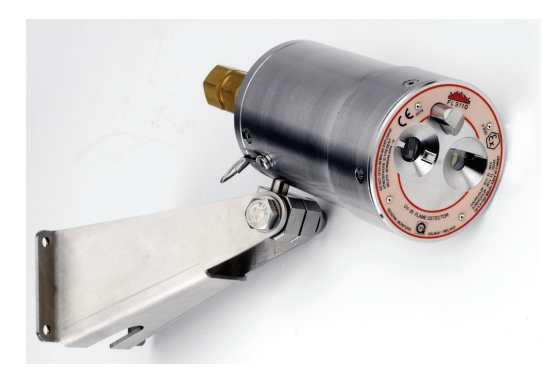
Figure 2 – Examples of UV/IR Flame Detectors