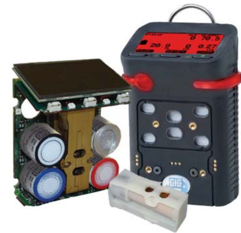
Figure 2: The G460 atmospheric monitor can support a wide variety of sensors including pellistor type LEL, PID and infrared combustible gases

To put this in perspective, less than 4% of the molecules in a bucket of diesel fuel are small enough to pass through the flame arrestor and enter the sensor. This is one of the reasons that pellistor LEL sensors show such a low response when exposed to the vapors of "heavy" fuels such as diesel, kerosene, jet fuel and heating oil.