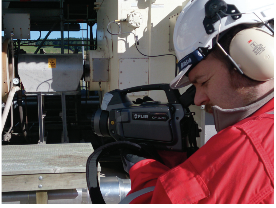
Thanks to thermal imaging cameras, Inspectahire can easily detect gases in difficult to reach or hazardous locations.