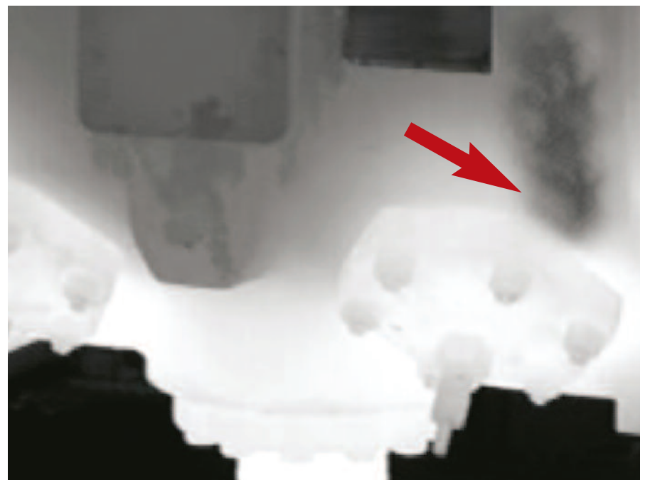
Inspectahire has been using thermal imaging cameras for a long time to detect dangerous gas leaks.

The Inspectahire team is using the GF320 optical gas imaging camera for maintenance inspections and for all its hydrocarbon detection jobs, in hydrocarbon production plants or for the inspection of any material that uses hydrocarbon as a fuel. The GF320 camera offers a range of