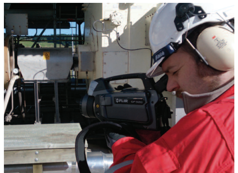
Thanks to thermal imaging cameras, Inspectahire can easily detect gases in difficult to reach or hazardous locations.