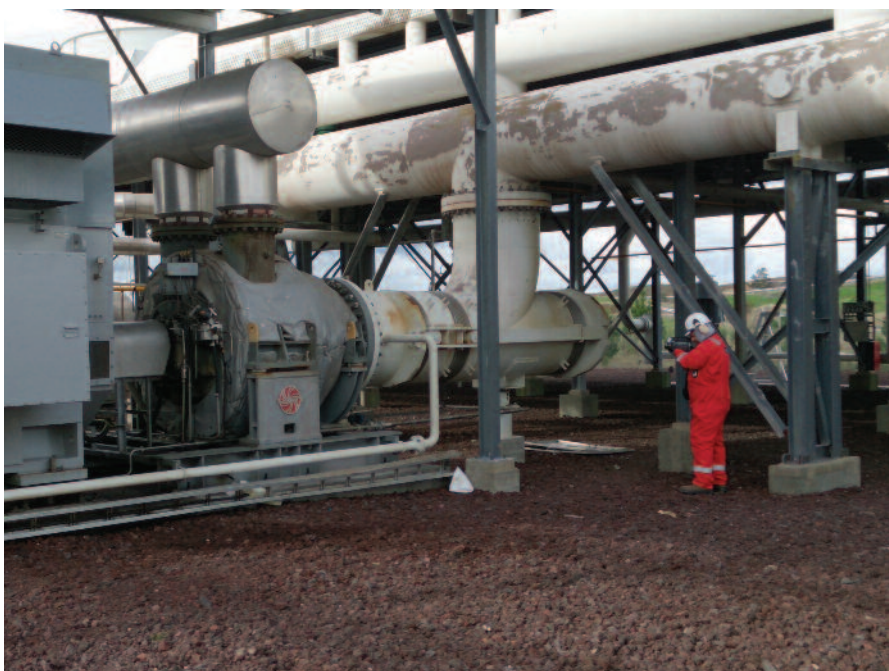
Small leaks can become big ones, that is why it is important to be able to detect them in an early stage.

tangible benefits compared to traditional hydrocarbon leak sniffers, because it can scan a broader area much more rapidly and monitor areas that are difficult to reach with contact measurement tools. The portable camera also greatly improves operator safety, by detecting emission at safe distance. "The camera is very ergonomic and very sensitive," comments Cailean Forrester. "If a hydrocarbon leak is there, you will certainly see it with the GF320 camera, even if it is a small one. Small leaks can become big ones, that is why it is important to be able to detect them in an early stage. With the GF320, we are sure of an accurate and reliable detection."