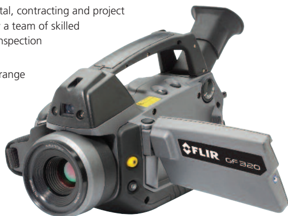
The FLIR GF320 Optical Gas Imaging (OGI) camera

Their expertise extends to a wide range of equipment and assets, both onshore and offshore, and in all environments – including harsh and hazardous. All Inspectahire's advanced inspection solutions are carried out in accordance with the requirements of ISO 9001 best practice.