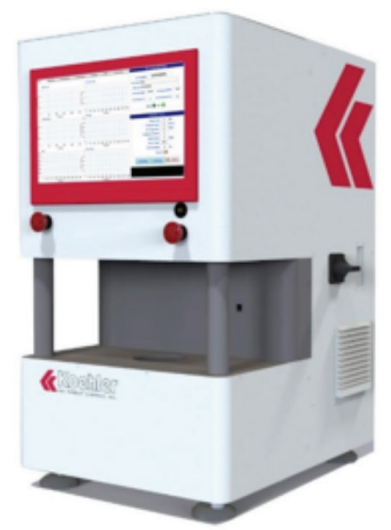
Figure 1: 4-ball wear testing method configuration [8]

EP properties of a lubricant. The 4-Ball EP Test uses the same ball position and technique described previously, but testing parameters are centered around wear produced from different levels of load, which is outlined by ASTM D-2596 [11]. As such, the purpose of this testing is to ascertain the proficiency of a grease's load carrying properties for high load applications like bearings [8]. The main parameter that is tested is the load wear index (LWI), which is a grease's ability to perform under extreme pressure conditions [8]. Throughout the duration of the test, three notable measurements are taken to calculate the LWI. The first measurement is the last non-seizure load (LNSL), which is taken at the highest applied load where lubrication is still present between the 4 balls [8]. Following this measurement is a continuous increase in load, where the point at which the lubricant film fully disappears is called the seizure region [8]. The final measurement is taken when catastrophic welding occurs. The presence of welding can be detected by the testing machine through the following behaviors [8]: