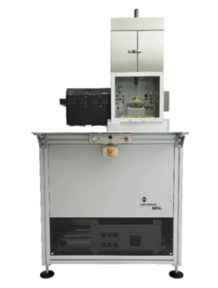
Figure 2: SRV Instrument [12]

mechanism by which sulfur-based EP additives operate is through physical adsorption, followed by chemisorption, cleavage of the sulfur, and its reaction to the metal surface [16]. Typically, this reaction operates at temperatures over 600°C [17]. Active sulfur EP additives are excellent at welding prevention by continuously sacrificing reaction layers under severe loads in a controlled manner [16]. Inactive sulfur is well suited for use with non-ferrous metals, as the high reactivity of active sulfur additives at lower temperatures can be corrosive to yellow metals and alloys [16,18]. A common EP agent used by the lubricant industry is sulfurized olefins. Sulfurized olefins come in two varieties: long-chain olefins that contain ~10-20% sulfur and short-chain olefins, such as isobutylene (~45% sulfur), dicyclopentadiene, and dipentene olefins (~35% sulfur) [5]. EP potency improves with higher sulfur content, making sulfurized isobutylene a very strong EP additive with exceptional scoring protection properties [5]. The downside of sulfurized olefins is their corrosive nature, warranting their replacement with other EP additives in applications like engine oils [18]. Other sulfur-based EP additives include sulfurized fats or esters, xanthates, thiocarbonates, dithiocarbonates, and molybdenum disulfide