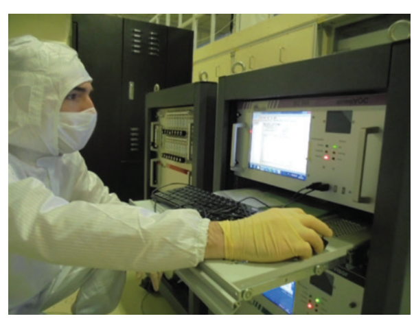
GC-MS analyser in cleanroom in Taiwan

Chromatotec<sup>®</sup> supervising software Vistachrom will provide automatically all concentrations for the listed compounds. Unknown compounds can be easily identified thanks to VistaMS identification function, linking the obtained mass spectrum to the NIST library.