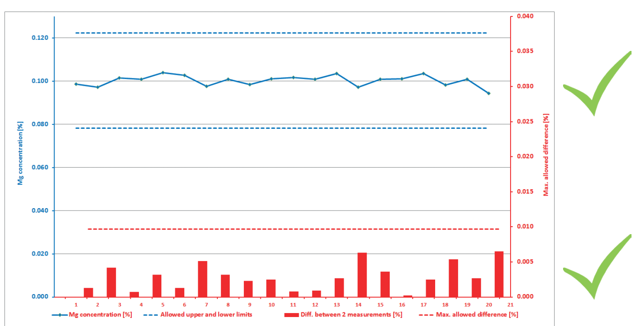
Figure 5: Repeatability test (n = 20) for Mg in lubricating oil and compliance with ASTM D7751

Figure 4: Calibration curve for Mo in mineral oil covering the range from 0.005 % to 0.075 % Mo