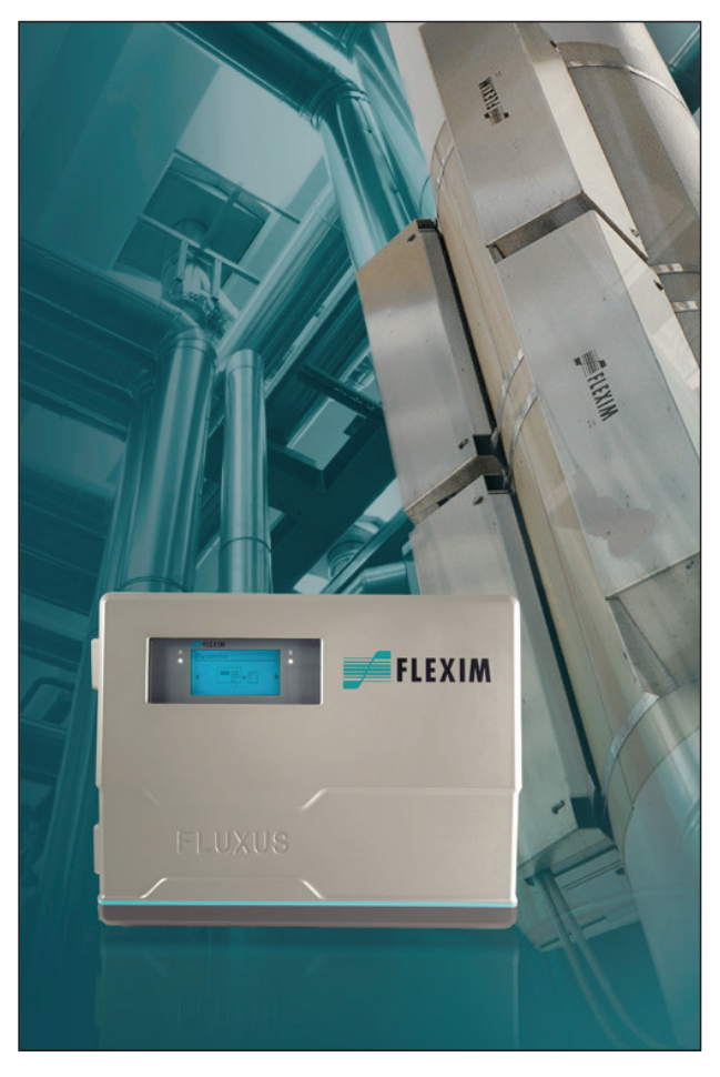
The start of a new dimension of non-invasive flow measurement with clamp-on ultrasonic technology: FLEXIM's new FLUXUS F/G721

In fact, the new ultrasonic system isn't just one device, it's actually two: The FLUXUS F721 is used for non-invasive flow measurement of liquids whereas the G721, which is externally identical in design, measures the flow rate of gases. Both systems are also available in two different housing versions, namely with aluminium housing for standard applications and a stainless steel version for use in highly corrosive environments and for use in potentially explosive atmospheres (ATEX, IECEX zone 2, FM class I, div. 2, EAC TR TS,