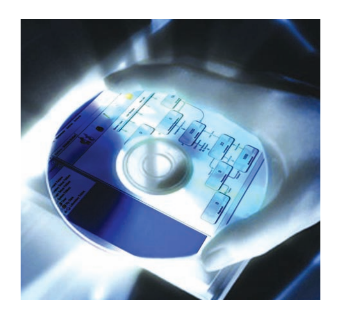
Image 5 – Thermo's SampleManager version 9 is scalable for a large user base

The standardization of SampleManager across all of PEMEX's gas processing facilities has resulted in a substantial reduction of the company's production costs. Indeed, standardization could achieve an estimated production cost savings of over $500,000 per year. Already there has been a notable increase in revenues generated by the improved productivity and quality of the products. The use of an enterprise-wide LIMS solution has helped PEMEX to improve product quality and accelerate time to market at a lower cost by converting raw data into real-time knowledge for fast, timely and