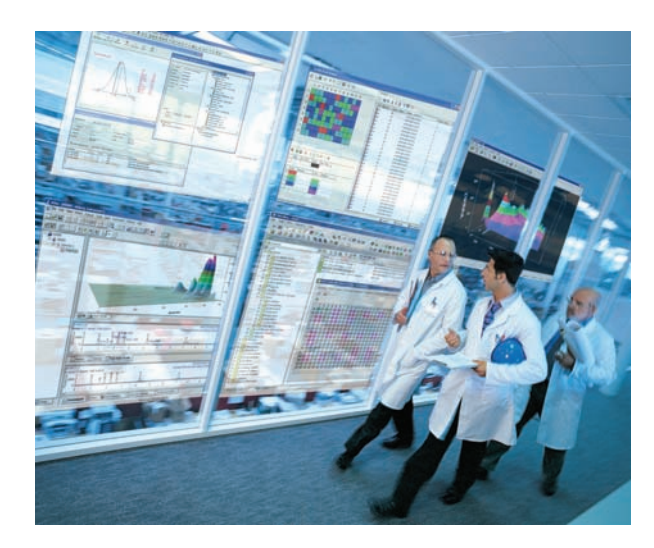
Fig 2 – SampleManager is used in process environments such as PEMEX

Oftentimes there are no organization-wide standards for testing and analysis, so routine analysis is dependent upon individual experience and skill. This presents significant constraints for personnel rotation. Moreover, analytical methods, job routines, reports and units often are not unified and consolidated.