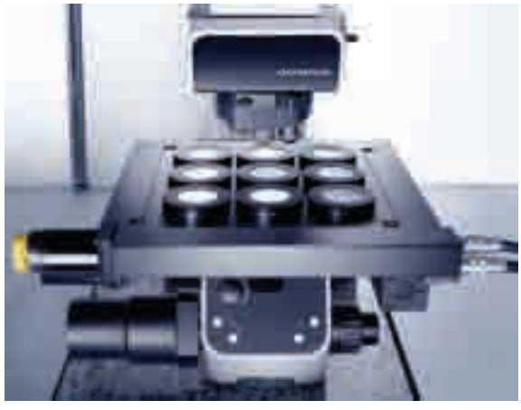
Figure 2: SGS uses a special multi-filter holder insert which can have up to 9 filters mounted on it simultaneously. The analysis is then conducted and evaluated automatically providing considerable time savings compared with filter analysis using just one filter holder.

this means ensuring that oils and fuels do not cause any subsequent contamination. Analysis of fresh and used oil samples regarding suitability and/or reusability with an insurance-related and legally recognized certification regarding the physical-chemical properties thus takes on a much greater significance. It's no surprise then that international standards define the parameters for investigating the cleanliness of oils and components. Heppes stated: "The cleanliness of all contaminantsensitive components, including oils, is specified according to international and national standards". The standards ISO 4406 and ISO 4407 are particularly applicable in the hydraulics fluids and fuels sector. "The ISO 4406 defines the numeric key for the degree of contamination by solid particles. The ISO 4407, however, defines the degree of solid contamination based on the microscopic counting method", noted Heppes. The analysis of the cleanliness of components in fluid circuits is described in detail by the ISO 16232 standard and the VDA 19 directive as well.