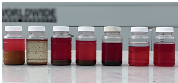
Figure 1. Color and Integrity Disparity Among Stored Diesel Fuels [6]

Gunk and sludge, shown in Figure 1, will severely damage the fuel injection system of the engine and will likely cause failure [2]. With 70.5 % of food transportation in the US being done by truck, keeping diesel engines running efficiently is integral to the economy [3]. Having a system to test the stability of stored, aged fuels is thereby helpful. ASTM D6468 is utilized for