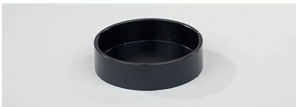
Figure 4. D Search Unit Sample Cup [6]

One application where the reflectometer is utilized outside the realm of fuels is food quality control, specifically potato and coffee products. As stated previously, the K30700 Reflectometer can be integrated with a predetermined grading scale, such as the pad filter scale shown in Table 1 or, for coffee ground grading, the Specialty Coffee Association (SCA) industry scale. The SCA industry scale is an efficient way to gauge quality across batches of coffee grounds. This grading scale can be programmed into the reflectometer. The main difference in the utilization of the reflectometer in the pad filter ASTM method and the SCA scale is the search unit. While the Y search unit is primarily used for solids such as filters, the D-search unit is used for coffee grounds, potato chips and powders. The only main alteration from Y to D search units is that the aperture is larger on the D search unit and there is a sample cup that works in conjunction with the unit where the test material is placed. An image of the sample cup and the D search unit are included below in Figures 4 and 5, respectively.