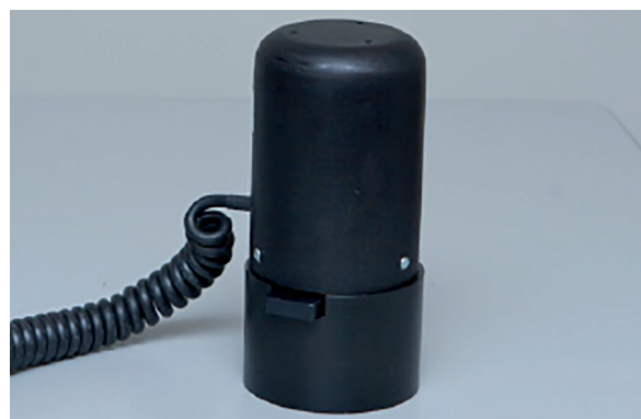
Figure 5. D-Search Unit [7]

while this possible application is quite useful, especially in the petroleum-grease industry, it will take time to gain a foothold in widespread applications especially material that does not experience uniform distribution of color. Non-uniformity is just one of the few key challenges keeping the reflectometer from widespread outreach of application. Solving this issue opens the door to many avenues not yet traveled down.