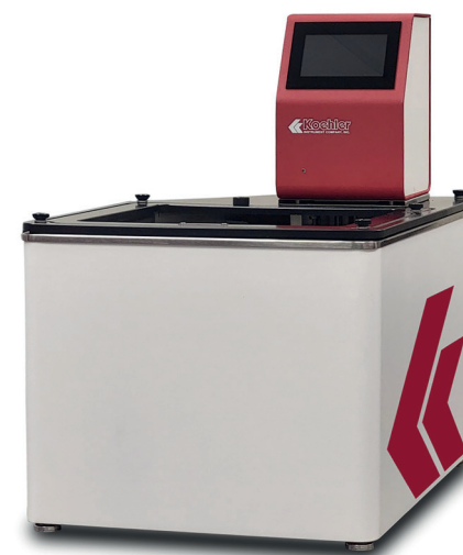
Figure 2. Koehler Precision Heating Bath

The pad filters used in the vacuum filtration system are then analyzed using the Koehler Instrument Co. K30700 Reflectometer. The system requires a swift, basic 2 step calibration where a black cavity standard and a standard plaque with a known, calibrated reflectance value are used. The black cavity calibrates the zero offset for dark current correction and gives the designation ZERO. The standard plaque with the known reflectance value usually is the highest reflectance value and given the denotation of STD on the reflectometer unit. The reflectance of the tested material is then plotted