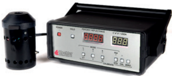
Figure 3. K30700 Reflectometer

this instrument allows for independent, unbiased, objective examination of the reflectance of the used pad filter and yields a reliable grading based on a dependable rating scale. The Koehler Instrument Co. K30700 Reflectometer is shown below in Figure 3, which depicts both the reflectometer and Y search Unit.