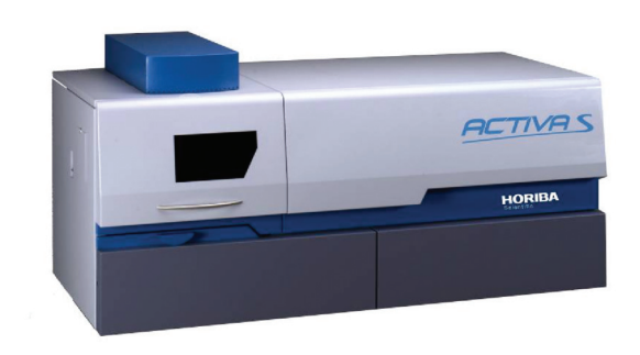
Figure 1: ACTIVA S

An ACTIVA S ICP spectrometer from HORIBA Scientific, figure 1, was used to perform the analysis. This instrument has been especially designed for reduced operating costs and high performance.