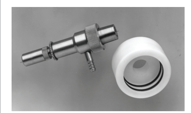
Figure 2: 1 mm HORIBA Jobin Yvon nebulizer

As well as the ICP spectrometer, the introduction system used has been especially designed for wear metals analysis. The nebulizer is made of a unique 1 mm i.d. Inox needle, Figure 2, and used with a Scott type spray-chamber. The nebulizer can handle organic solvents even with undissolved particles, which may often be observed in used oils. The robustness of the method is then greatly improved by eliminating the risk of nebulizer blockage. This introduction system is combined with the standard fully demountable torch and the unique sheath gas device for enhanced stability and reduced memory effects.