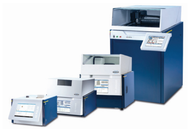
Fig. 4: From compact EDXRF benchtop instruments to high-end, full power floor standing WDXRF instrumentation (S2 POLAR, S2 PUMA, S6 JAGUAR, S8 TIGER, from left to right)