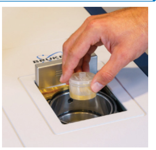
Fig. 3: Petrochemical samples require no or only very little sample preparation, making daily routine analysis simple and fast