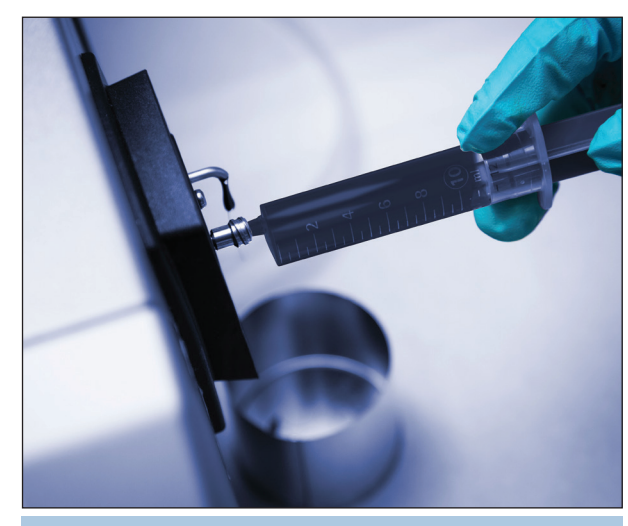
Figure 1. A hot bitumen sample is injected into the heated DMA 4200 M measuring cell

Density measurements on bitumen have to be carried out with a pycnometer according to EN 15326 titled "Bitumen and bituminous binders - Measurement of density and specific gravity -Capillary-stoppered pycnometer method", the equivalent to ASTM D70. This determination method requires a lot of experience, skill, and time, not only for the measurement itself, but also for the cleaning procedure after each measurement. Samples are usually submitted to the laboratory in tin cans, and have to be brought to elevated temperatures to liquefy the bitumen so it can be transferred into the pycnometer according to a standard which clearly defines the duration and temperature for heating the sample.