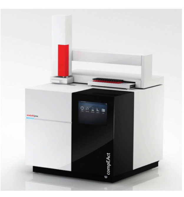
Figure 1: compEAct SMPO with LS 2 liquids sampler and EAvolution software

The MPO renders interfering nitrogen compounds harmless. This happens fully automatically as integral step of the analysis process.