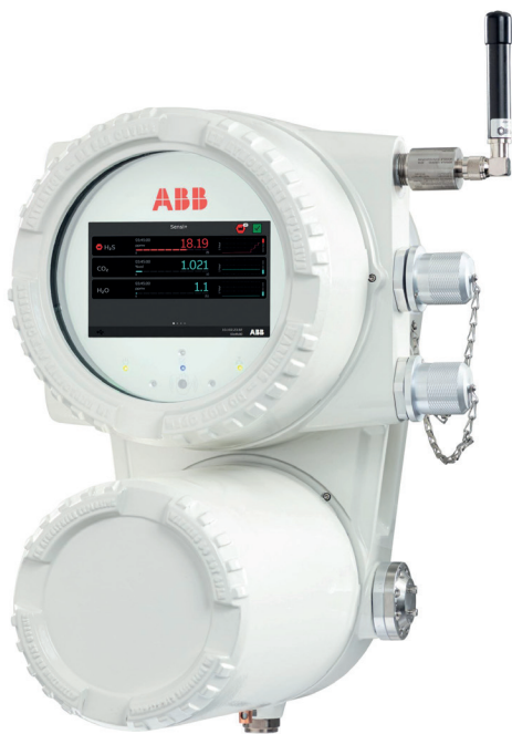
ABB Sensi+ designed for natural gas contaminants monitoring

This corrosion occurs through hydrogen-induced cracking, or hydrogen embrittlement, a chemical phenomenon that causes metal alloys to fracture due to a build-up of hydrogen molecules within the crystal lattice structure. This can occur during forming or finishing processes, but the most common mode is the gradual diffusion of hydrogen atoms into a component's structure throughout its service life.