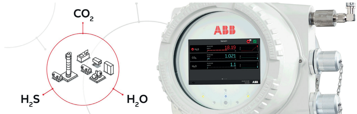
ABB single analyzer for multiple gas contaminants monitoring

Other methods include electrochemical gas sensors. These consist of a sensor, counter, and reference electrode, which are contained in a housing with a gas-permeable membrane. An electrochemical reaction occurs when the gas reaches the working electrode. Although designed to identify a specific gas, most will also respond to gases other than the target gas, which can lead to the non-target gas masking the presence of the target gas.