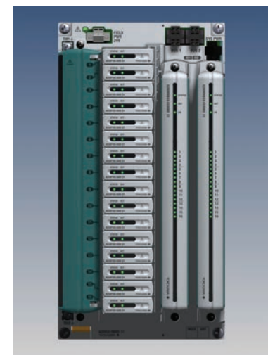
Fig.3. Yokogawa's N-IO (Network-IO) field I/O device for handling multiple types of I/O signals

N-IO (Network-IO) is a field I/O device with a versatile I/O module that can handle multiple types of I/O signals (Fig. 3). Control systems rely on field I/O devices for the transfer of