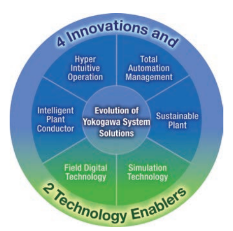
Fig. 1. Key technologies and enablers for the next generation of control systems

The introduction of these crucial new control system components ushers in an operating environment that keeps everyone fully aware, well informed, and ready to face the next challenge. The result is a dramatic reduction in the time required to configure and install a control system.