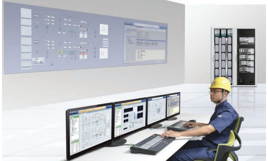
Fig. 2. Yokogawa's CENTUM VP R6.01 integrated production control system

Yokogawa has also identified two key technologies which it is using in developing these new innovations: field digital technology and dynamic simulation technology. These innovations are summarised in Fig. 1.