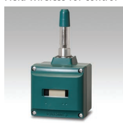
Fig. 5. Yokogawa's multi-function wireless adaptor enables wired devices that transmit and receive digital on/off signals or receive 4–20 mA analogue signals to function as ISA100 Wireless™ field wireless devices

As indicated above, field digital technology is one of the key drivers in optimising plant operation. Field wireless technology can ease the application of field digital devices to process plants with flexibility, safely, and lower installed cost (Fig.5).