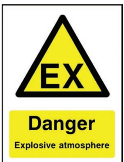
Fig. 2. Example warning sign.

The warning sign for places where explosive atmospheres may occur vary in design but must incorporate the following distinctive features: