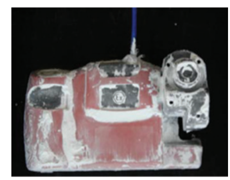
Figure 3 shows the final result of the IP5X testing, after Figure 3: Pre and post IP5X testing the drop test.