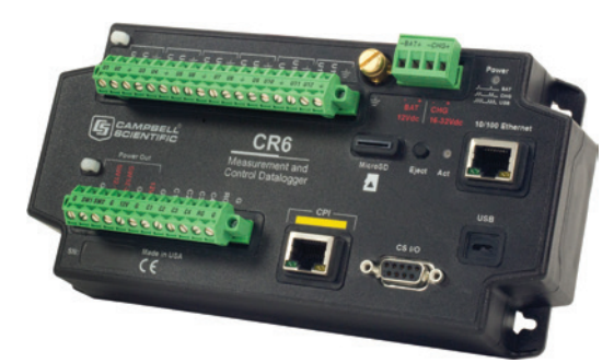
The CR6 Datalogger offers high-quality measurements, fast processing speed and easy wiring in a compact and robust design.

The other main areas that we are focussing on at the show this year are aviation related technologies; sensors for visibility and