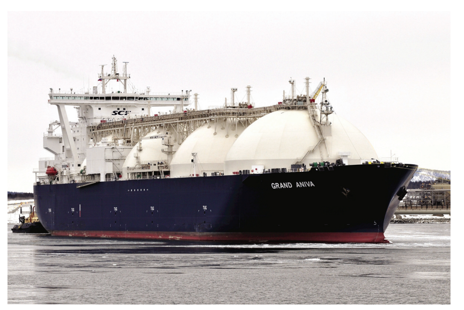
Sakhalin Energy has standardized on SampleManager LIMS in its state-of-the-art LNG/OET Laboratory.

changed whenever necessary. Standard D1945, for example, which pertains to analysis of natural gas by gas chromatography, was updated in 1991, 1996, 2001 and 2003. Revisions can range from recommendations for new instruments such as detectors or autosamplers to sampling frequencies and other changes that are equally important for compliance. An old-fashioned paper based system would require a huge expenditure of resources to monitor such irregular updates. Not only would a laboratory have to check regularly for revisions, it would also have a limited amount of time to prepare itself to modify a test. The automation provided by a LIMS gives lab managers the lead time to think more strategically about implementing these changes, some of which can have dramatic impact on existing workflows. New and updated workflows can now be prepared ahead of time, and then activated when the whole laboratory goes live with the new version of the standard, ensuring complete consistency across the organisation.