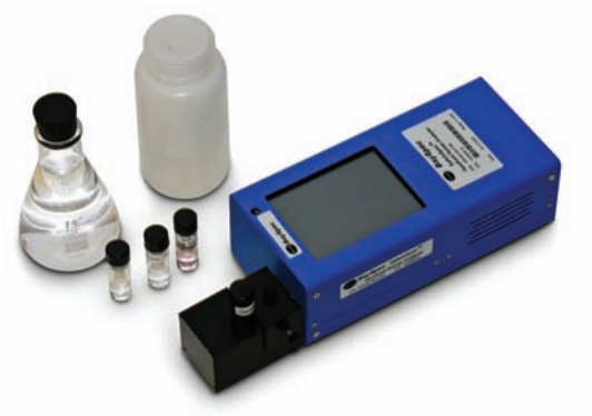
Figure 1. The "experimental setup." The experiment consists of holding the laser power button for a few seconds to shine laser light on the sample vial. In this case is the experiment takes approximately four seconds