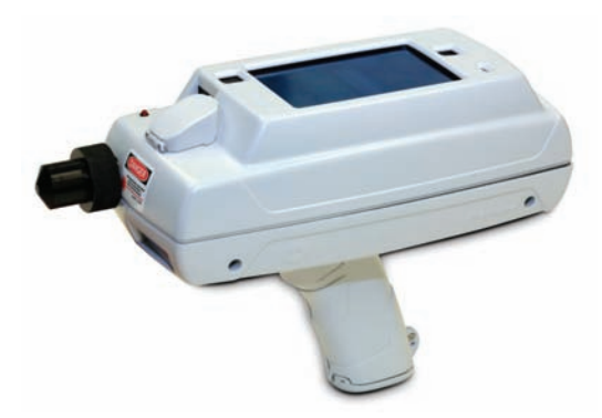
Figure 2. An alternate configuration with improved ergonomics for point and shoot applications