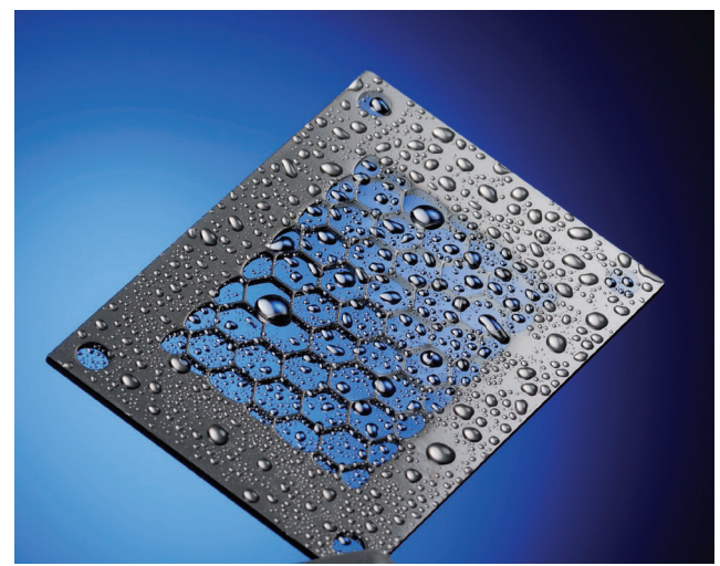
Figure 3: Vacuum Seal for protection of the HighSense™ detector.