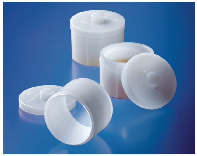
Figure 2: Dedicated liquid cups for lubricant oils