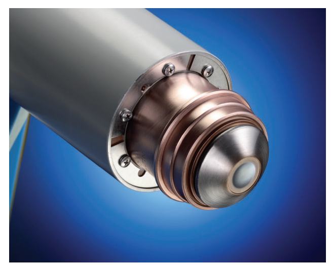
Figure 1: Powerful 400 W HighSense™ X-ray tube.