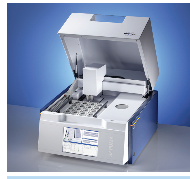
Figure 3: S2 PUMA XY Autochanger with 20 position sample tray

Figure 1: Energy-dispersive X-ray spectrometer (EDXRF) S2 PUMA