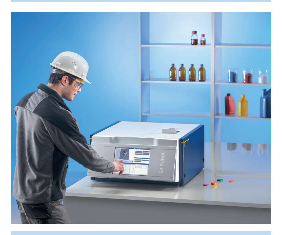
Figure 1: Energy-dispersive X-ray spectrometer (EDXRF) S2 PUMA

Table 1: Repeatability and accuracy data of 10 measurements of a QC sample for additives in lubricants according to ASTM D7751 \,