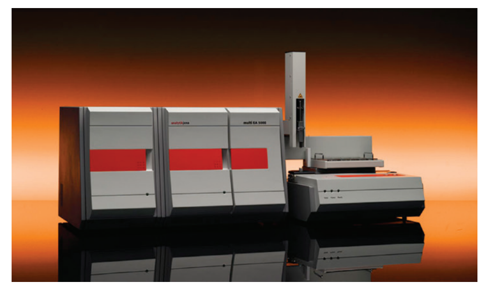
Fig. 1: multi EA® 5000 – automatic chlorine analysis system in horizontal mode

boat drive. The combustion takes place in a biphasic process. During the first phase volatile components were evaporated in an inert gas atmosphere and purged into the combustion zone, to be oxidised completely at 1050°C. In the second step remaining heavier sample components and possibly formed pyrolysis products, were combusted in pure oxygen. Before they were guided to the coulometer cell, the reaction gases, including HCl, are cleaned and dried by the auto-protection system and sulfuric acid. Meanwhile a powerful heating avoids condensation, which would affect Cl recovery remarkably. When HCl has arrived, it is absorbed in the cell electrolyte and titrated subsequently. An integrated cell cooling, drift control and usage of lightproof material, ensure a stable performance. This enables precise analysis results even for the lowest trace contents.